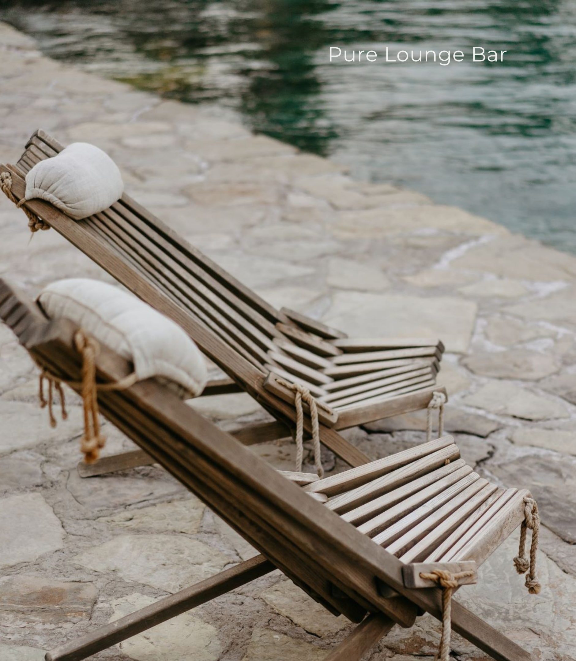
Pure Lounge Bar